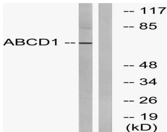
Western blot analysis of lysates from Jurkat cells, using ABCD1 Antibody. The lane on the right is blocked with the synthesized peptide.