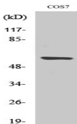
Western Blot analysis of various cells using Cleaved-MMP-15 (Y132) Polyclonal Antibody