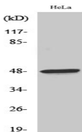
Western Blot analysis of various cells using Thrombin R Polyclonal Antibody