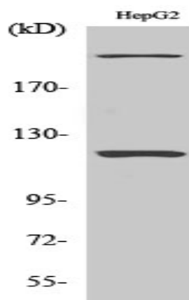
Western Blot analysis of various cells using NP220 Polyclonal Antibody