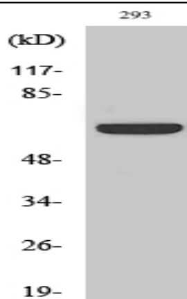
Western Blot analysis of various cells using Kv1.3 Polyclonal Antibody diluted at 1:500