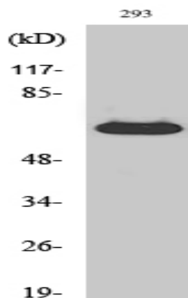
Western Blot analysis of various cells using CD5 Polyclonal Antibody