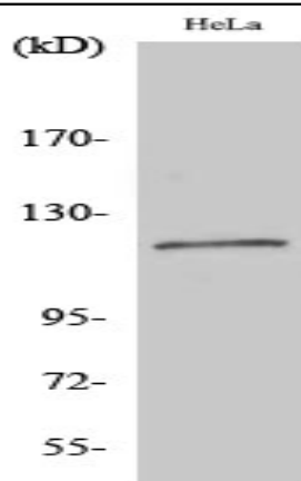
Western Blot analysis of various cells using BubR1 Polyclonal Antibody