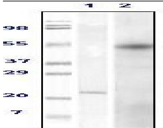
Western Blot analysis using FoxP3 Monoclonal Antibody against truncated Foxp3 recombinant (1) and HEK293 cell lysate (2).