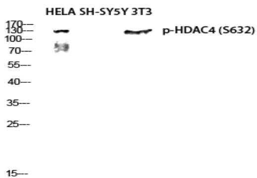
Western blot analysis of HELA SH-SY5Y 3T3 lysis using Phospho-HDAC4 (S632) antibody. Antibody was diluted at 1:1000