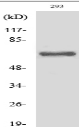
Western Blot analysis of various cells using Cleaved-ITI-H2 (D702) Polyclonal Antibody