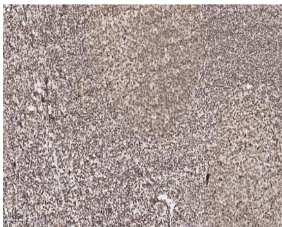
Immunohistochemical analysis of paraffin-embedded human tonsil. 1, Tris-EDTA,pH9.0 was used for antigen retrieval. 2 Antibody was diluted at 1:200(4° overnight).3,Secondary antibody was diluted at 1:200(room temperature, 45min).