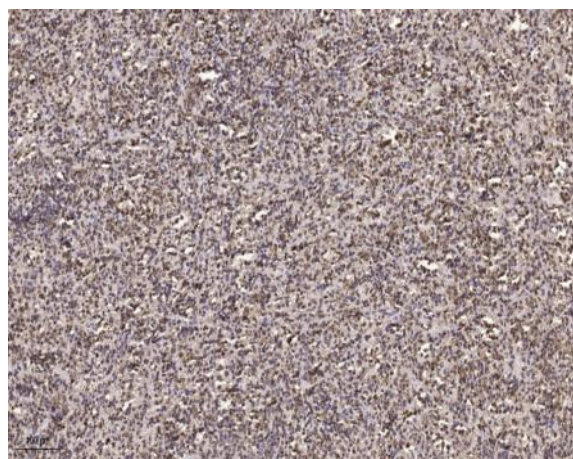
Immunohistochemical analysis of paraffin-embedded human spleen. 1, Tris-EDTA, pH 9.0 was used for antigen retrieval. 2 Antibody was diluted at 1:200 (4° overnight). 3, Secondary antibody was diluted at 1:200 (room temperature, 45min).