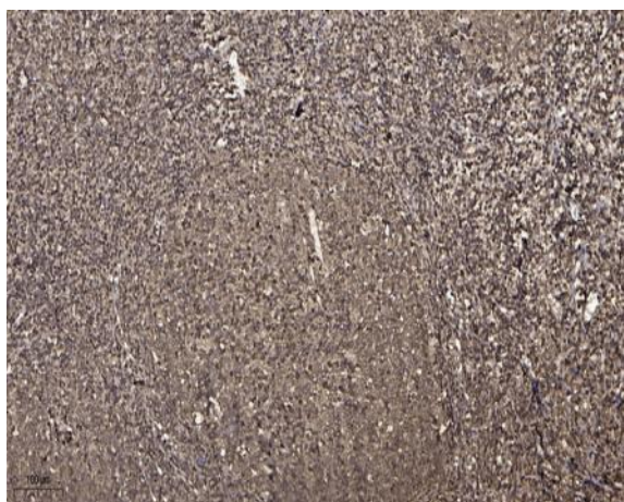
Immunohistochemical analysis of paraffin-embedded human tonsil. 1, Antibody was diluted at 1:200(4° overnight). 2, Tris-EDTA,pH9.0 was used for antigen retrieval. 3,Secondary antibody was diluted at 1:200(room temperature, 45min).