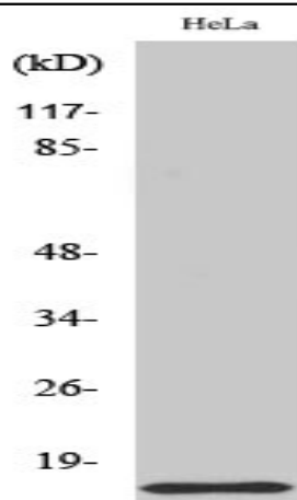
Western Blot analysis of various cells using COX17 Polyclonal Antibody